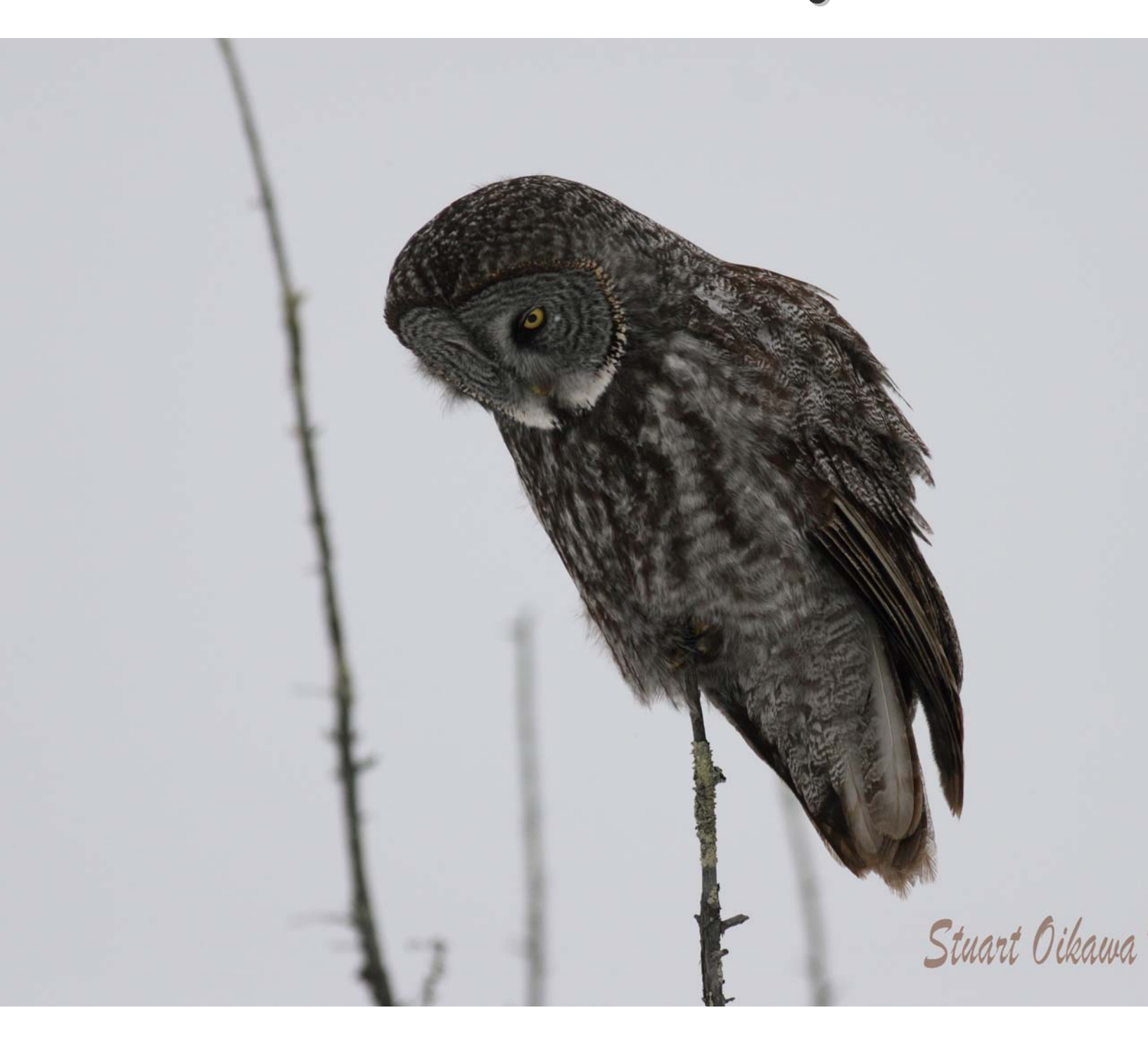
Annual Report 2009